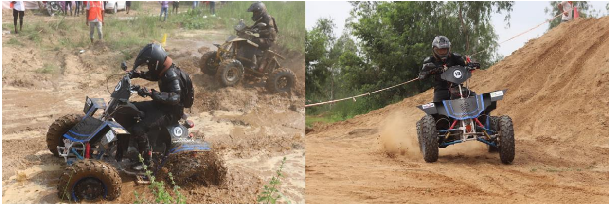
Glimpse of Quad-Torc 2019 (Bijnor, U. P.)