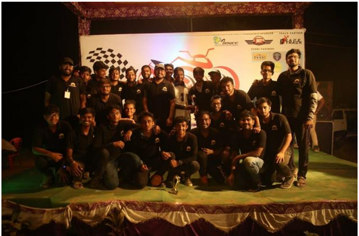
Students Team Technocrats at Quad-Torc 2019 (Bijnor, U.P.)