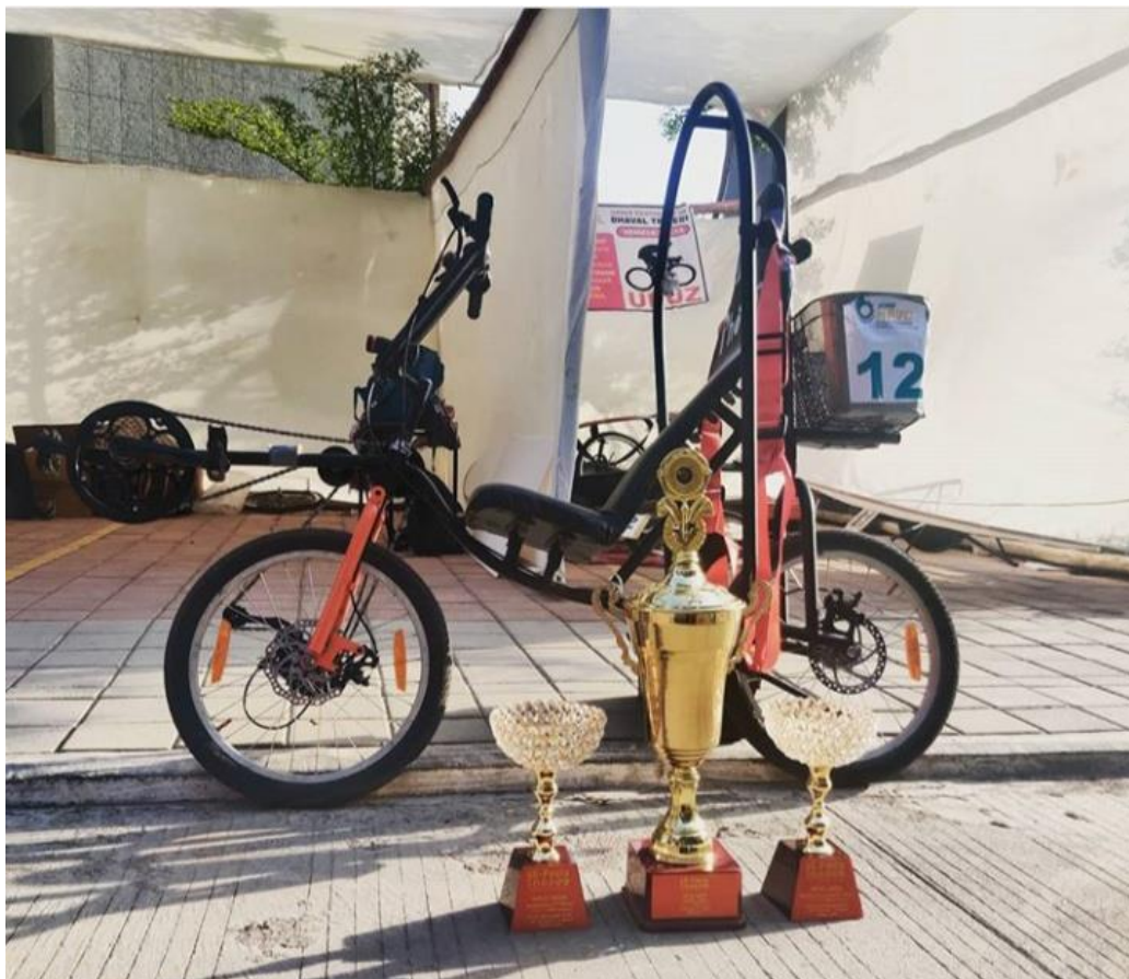
Team Photon at ASME Human Powered Vehicle Challenge 2020