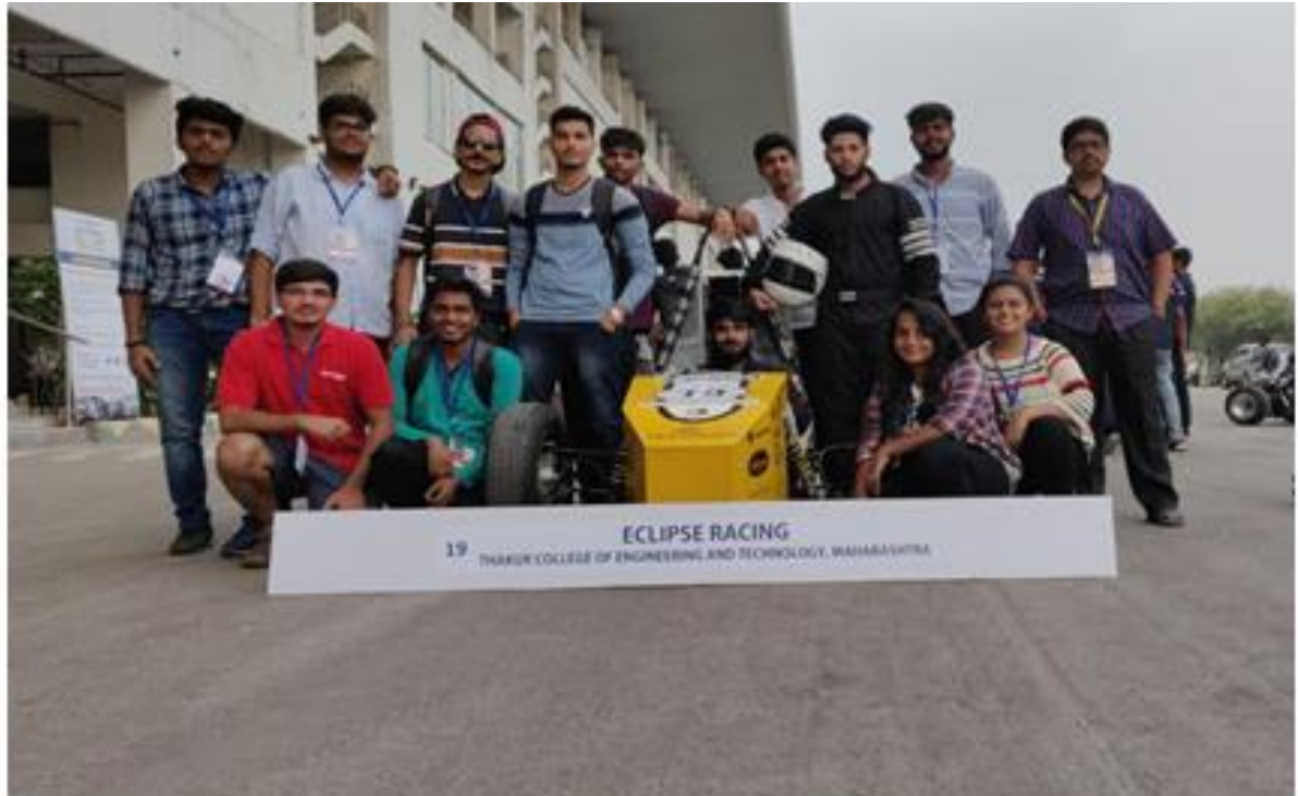
Students Team Eclipse Racing at SUPRA SAE India 2019 (Buddh International Circuit, Greater Noida (U.P.))