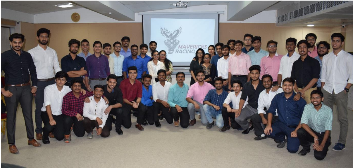
Students of Team Mavericks Racing at Campus Mentorship Programme by Formula Imperial 2020